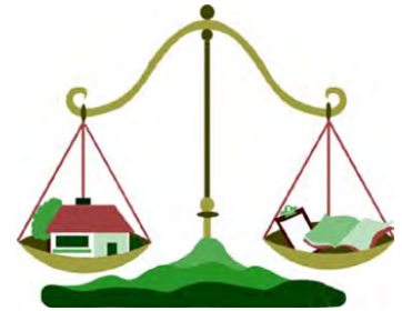
3 Most people have trouble balancing the budget