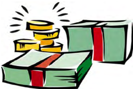
6 We've got a lot of cash to spend.