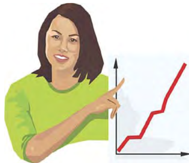
4 We had a big profit this year.