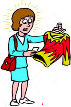
1 The price is just too expensive.