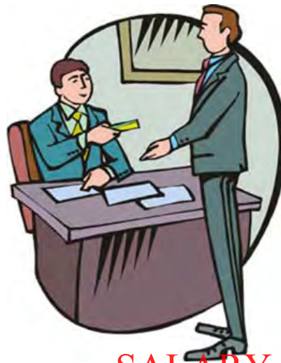
7 I get my salary at the end of every month.