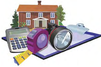
2 When you buy a house, there are so many costs