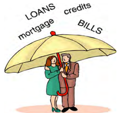
8 We are really in debt now.