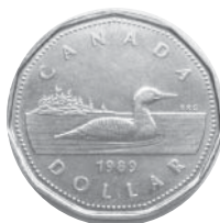
Loonie $1.00 One dollar