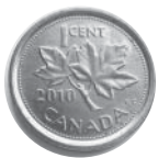
Penny $.01 or 1¢ One cent