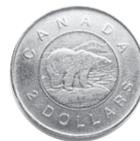
Toonie $2.00 Two dollars