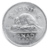
Nickel $.05 or 5¢ Five cents