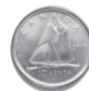
Dime $.10 or 10¢ Ten cents