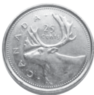
Quarter $.25 or 25¢ Twenty-five cents