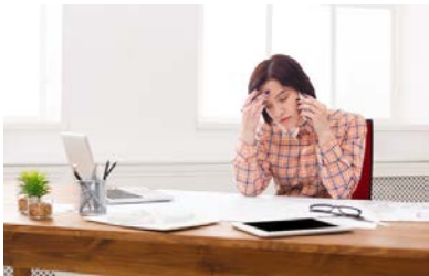
1 making a call

Complete the telephone conversation between a company and a customer.