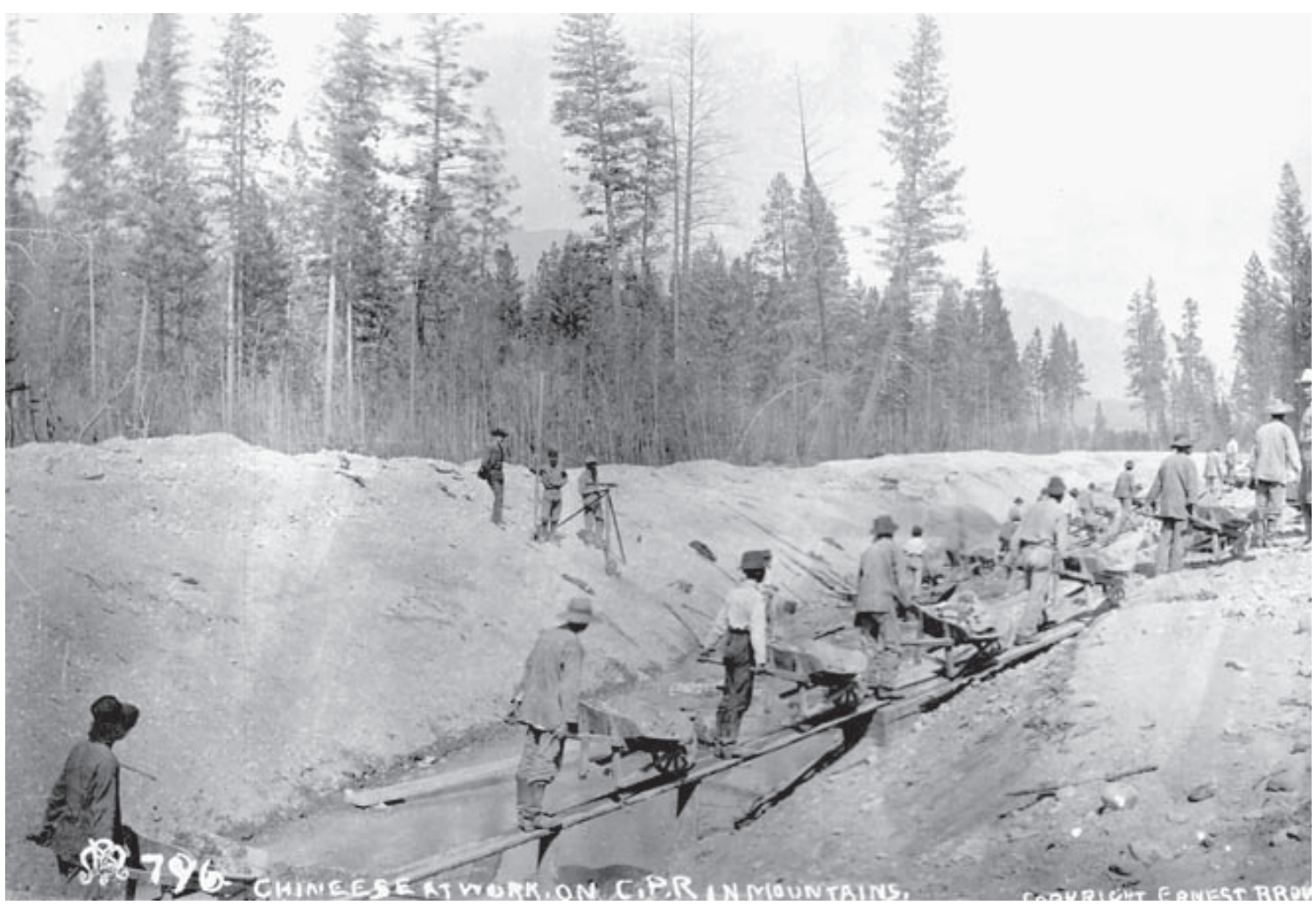
Library and Archives Canada, C-006686B, Boorne & May, 1884. http://data2.archives.ca/ap/c/c006686.jpg