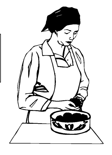
Serves 6 people

lbs. = pounds c. = cup or cups Tbs. = tablespoon tsp. = teaspoon